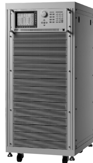
Model 61611, 61612