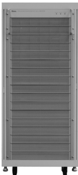
A615103 Parallelable Power stage Unit 18KVA